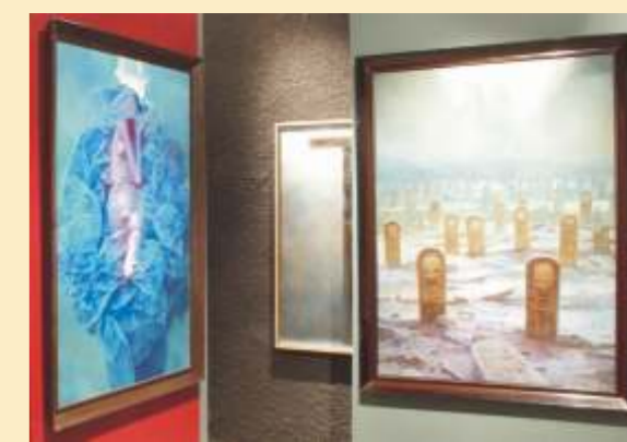
Collection of works by Zdzisław Beksiński