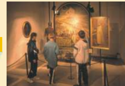
The Jasna Góra Arsenal

Jasna Góra Information Centre - phone no. +48 34/365 38 88 ul. Kordeckiego 2, tel. +48 34/365 38 88 www.jasnagora.pl, e-mail: jci@jasnagora.pl