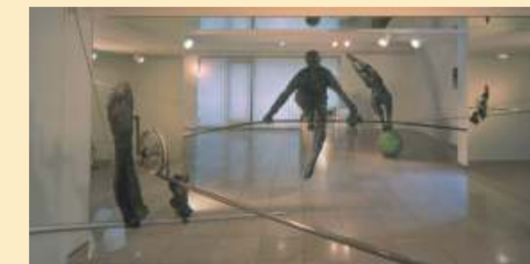
Unique "balancing" sculptures by Jerzy Kędziara

Permanent exhibition of old historical railway vehicles and equipment Częstochowa Stradom Railway Station ul. Pułaskiego 100/120, tel. +48 34/363 59 31, 322 26 89, www.tpkww.one.pl Open: Tuesdays, Thursdays, Saturdays 10:00 - 13:00 or by appointment.