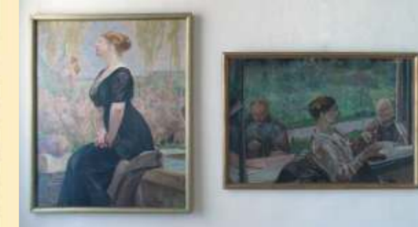
Exhibitions of Jacek Malczewski's paintings

ul. Św. Barbary 41, tel. +48 34/368 53 61 Open: Tuesday - Saturday 9.00 - 13.00